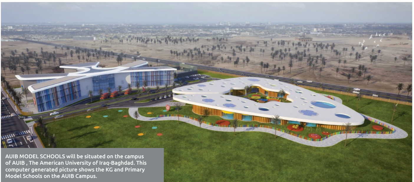
AUIB MODEL SCHOOLS will be situated on the campus of AUIB, The American University of Iraq-Baghdad. This computer-generated picture shows the KG and Primary Model Schools on the AUIB Campus.

learning to each student's strengths, needs and interests to ensure their mastery of high academic standards and social achievement. AUIB Model Schools will provide opportunities for students to develop as socially responsible global citizens and to be inclusive and welcoming to every student in the community they serve. The schools will cater for the physical, academic, social, emotional and spiritual needs of all students in a supportive and caring environment.